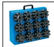
Die Rack (12 pc.) DIERACK-H69