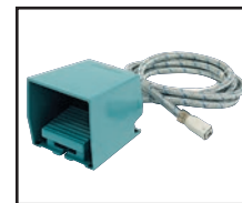
Electric Foot Pedal PEDAL-ES