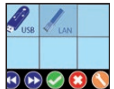
ES3 Upgrades (pg. 35)

Because we continually examine ways to improve our products, we reserve the right to alter specifications or discontinue products without prior notice.