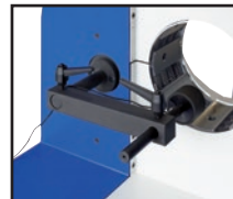
Back Limit Switch