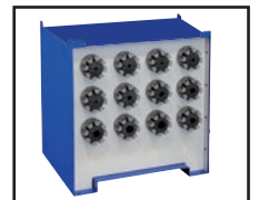
Die Holder Base (12 pc.) DIEBASE-H69