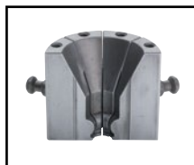
Custom Made Dies (pg. 41)