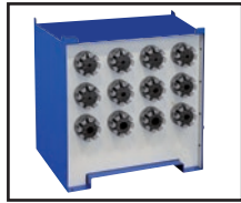
Die Holder Base (12 pc.) DIEBASE-H69