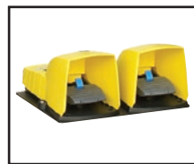
Electric Foot Pedals PEDAL-KC1