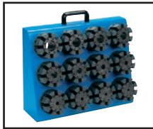
Die Rack (12 pc.) DIERACK-H69