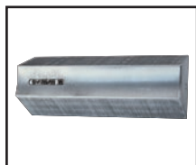
Marking Dies (pg. 41)