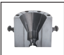
Custom Made Dies (pg. 41)

* Hand and air pumps are not interchangeable. Air pump version is a separate product.