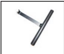
Die Change Tool