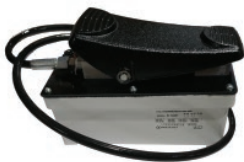
Air pump version also available*

Description: Portable and powerful. Its built-in carrying handle and 95 lbs. weight makes it excellent for switching between on-site and in-shop use. Crimps up to 1 1/2" two wire, and 1 1/4" 4 SP hydraulic hoses.